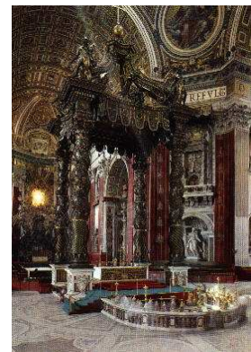
Canopy over the high altar of St. Peter's Cathedral, 1624-33